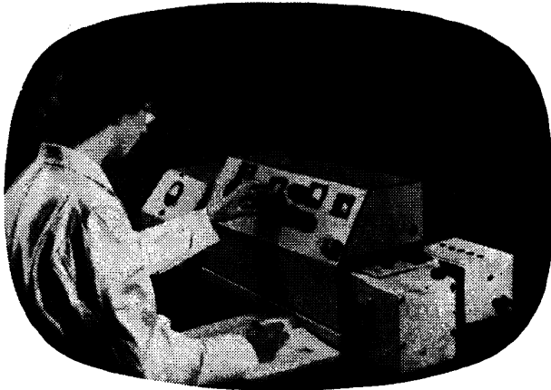
Operator with Unicam SP.500 Spectrophotometer

for ease and speed in the measurement of absorption from 2,000 to 10,000Å